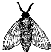
Figure 2: A sample black and white graphic (.pdf format) that has been resized with the includegraphics command.

spans two columns. To do this, and still to ensure proper “floating” placement of tables, use the environment figure* to enclose the figure and its caption (See Figure 3). And don’t forget to end the environment with figure* , not figure!