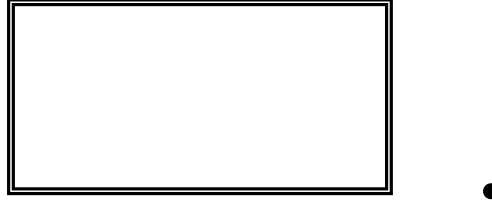
Figure 1.2: Some TikZ picture.