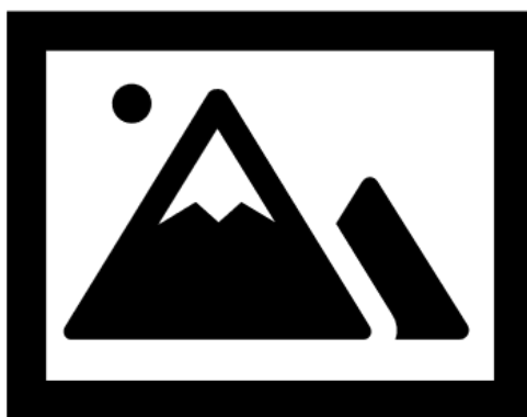
Figure 1: This is an example figure.

28 Figures should be called out within the text and numbered in the order of their citation in the text. 29 Every figure must have a descriptive title beginning with “Figure [Number] ...” All figure titles should be either a phrase or a sentence; do not mix the two styles. See Figure 1 for example.