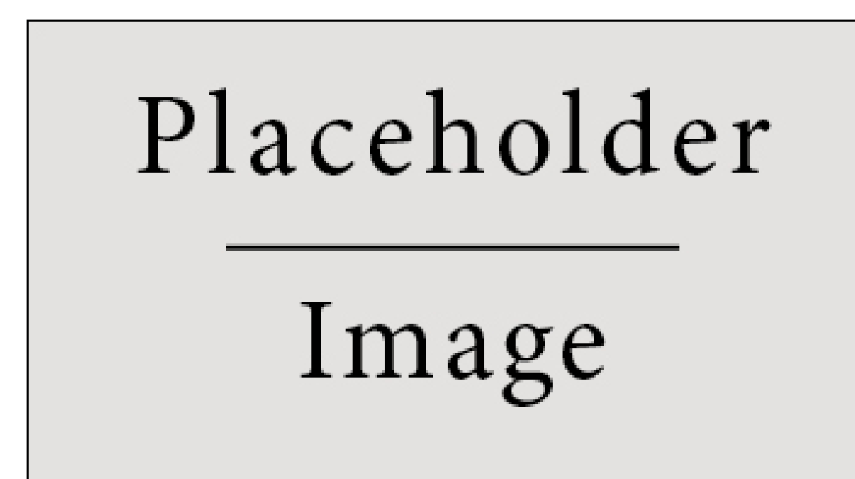
Figure 2: Figure caption

Rule of thumb: The poster is supposed to be readable in screen laptops. Check your final design in full screen.