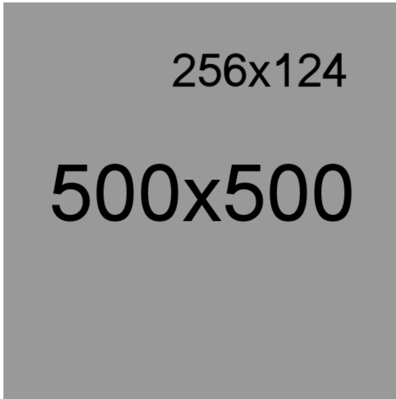
Figure 2.7: Inset image