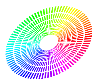
FIGURE 2.2: figure2