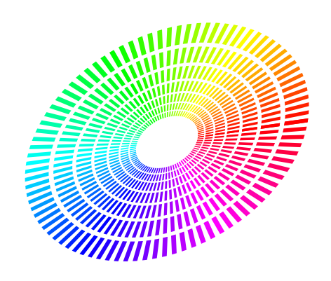
Figure 2.1: figure1