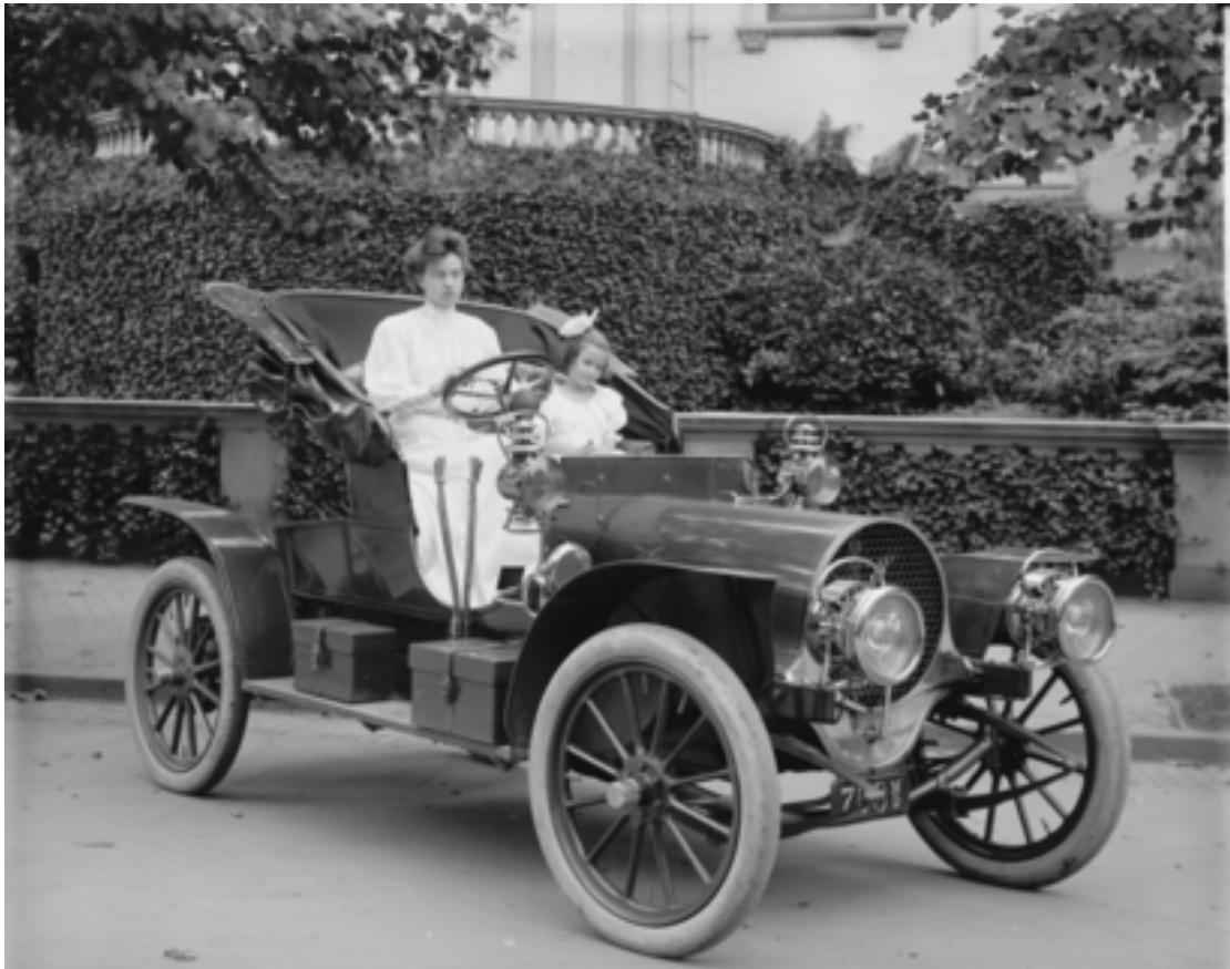
Figure 1: 1907 Franklin Model D roadster.

and follow it with another numbered equation: