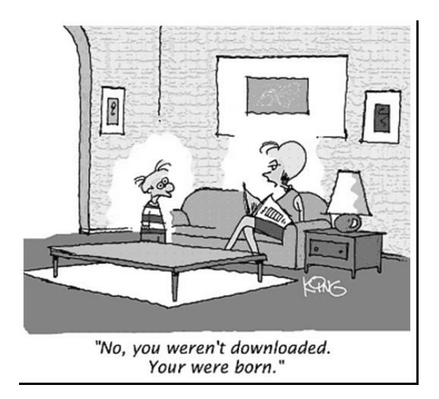
Figure 1. A typical figure

Figure and table captions should be centered if less than one line (Figure 1), otherwise justified and indented by 0.8cm on both margins, as shown in Figure 2. The caption font must be Helvetica, 10 point, boldface, with 6 points of space before and after each caption.