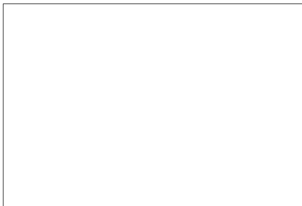
Figure 1. Example of caption. It is set in Roman so that mathematics (always set in Roman: B \sin A = A \sin B ) may be included without an ugly clash.

216 217 218 219 220 221 222 223 224 225 226 227 228